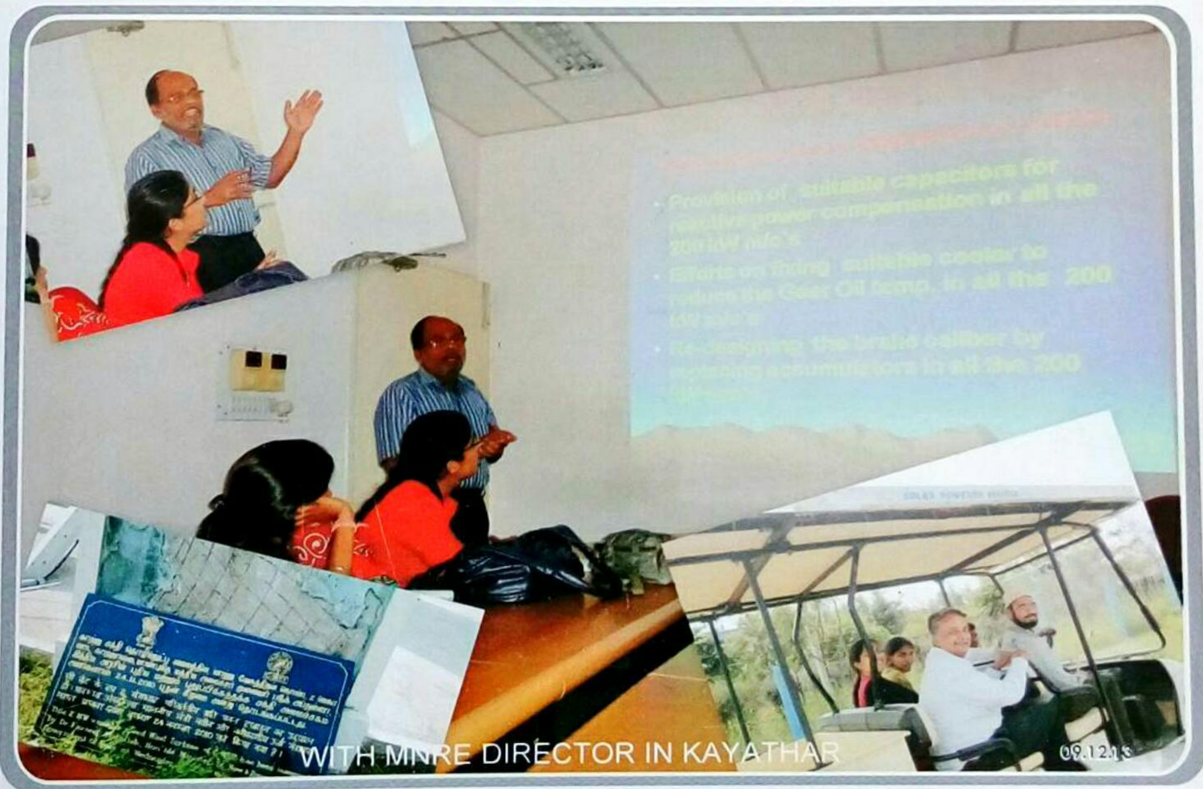
WITH MINRE DIRECTOR IN KAYATHAR