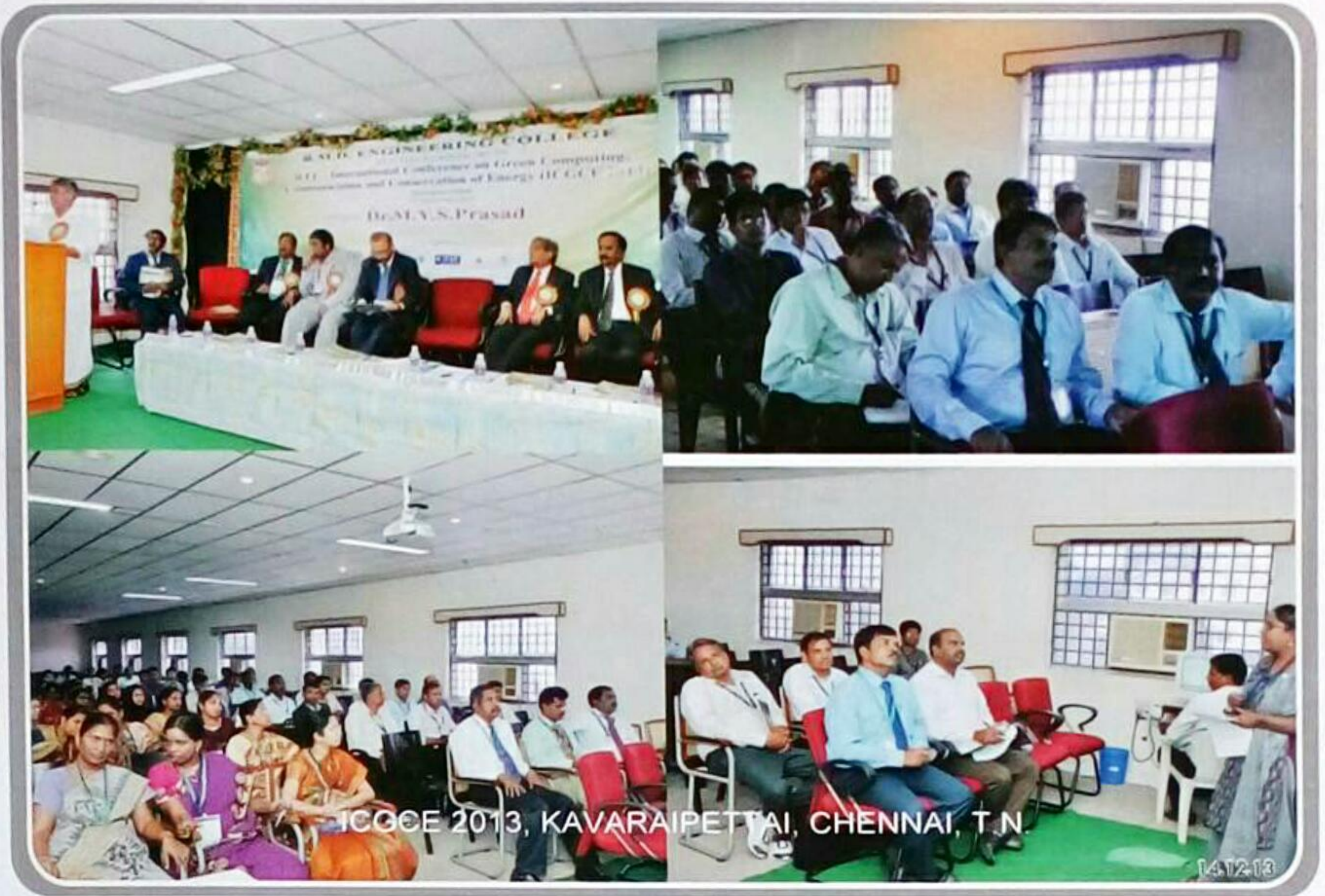
ICCEE 2013, KAVARAIPETTAI, CHENNAI, T.N