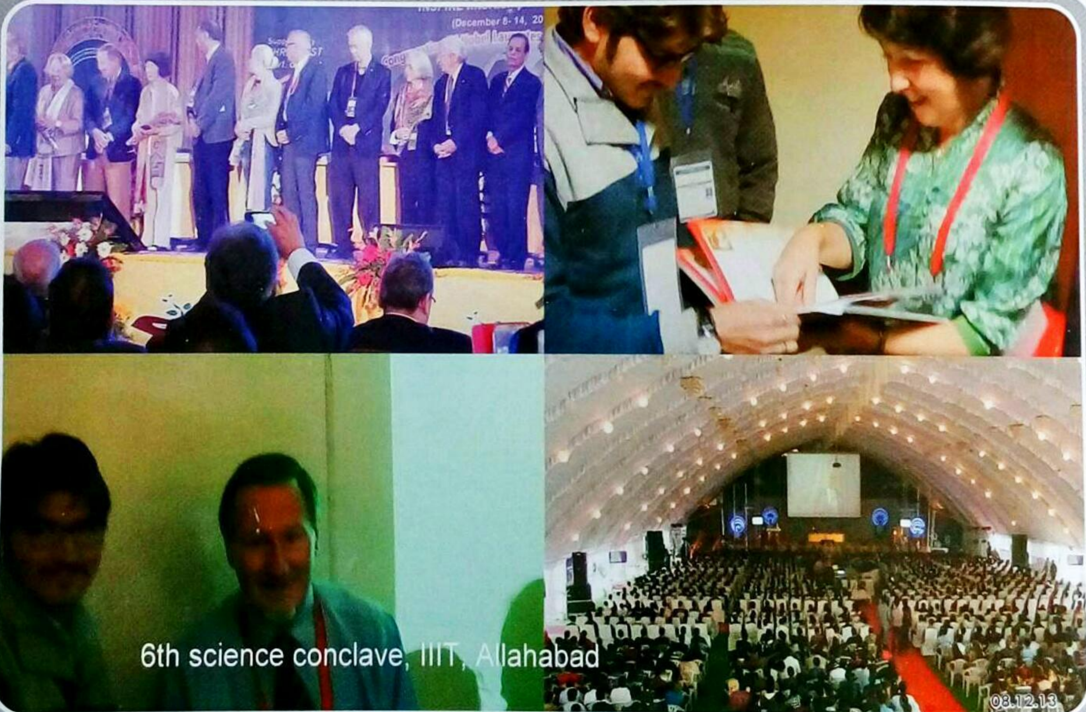
6th science conclave, IIIT, Allahabad