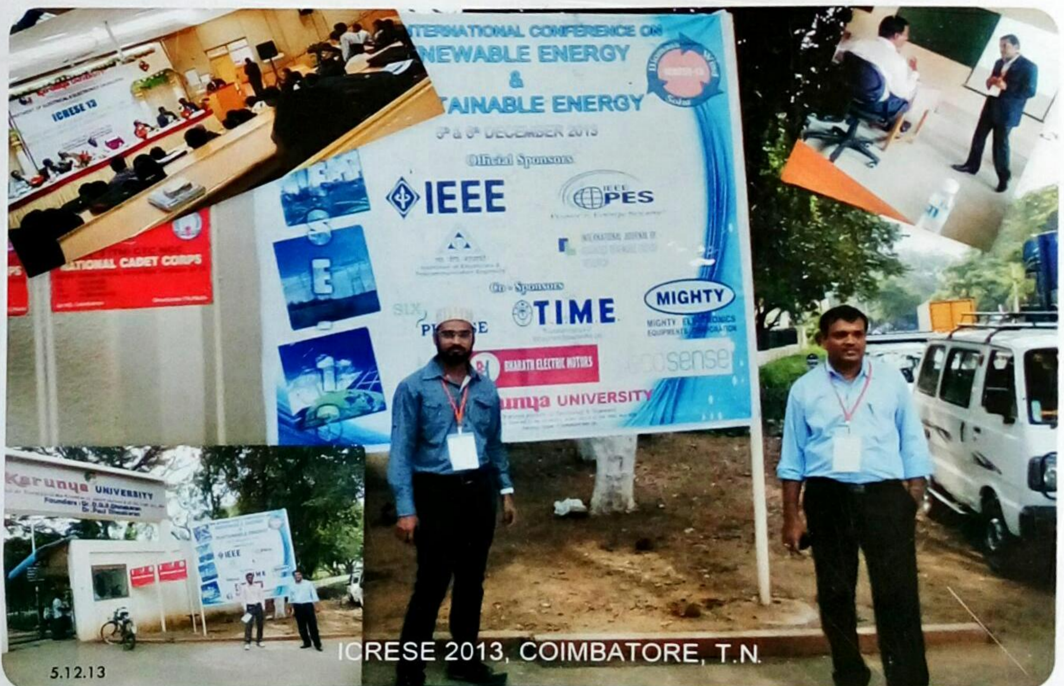
ICREESE 2013, COIMBATORE, T.N.